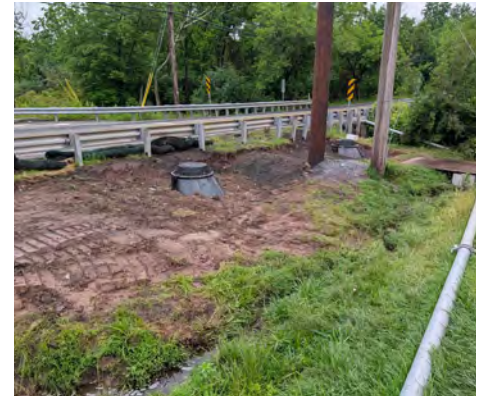
All patched up and good as new! Big thanks to our Municipal Authority staff for their hard work.