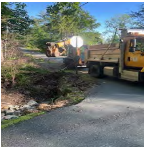
Stormwater Ditch Cleaning