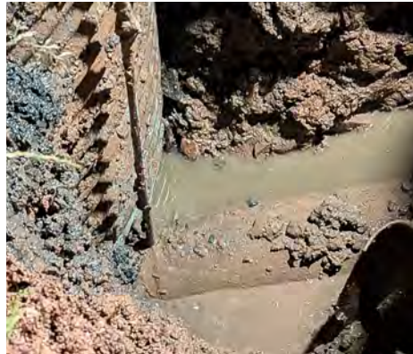
Damage to the pipe called for immediate action. Here you can see the leak.