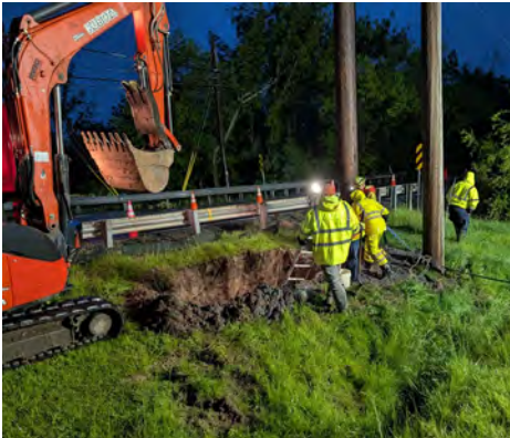
Staff explore the affected area of the pipe break with equipment late at night.

While waiting for professional assistance, limit water use to prevent further stress on your system. To help avoid future problems, we recommend periodic sewer lateral inspections, especially in older homes. The New Hanover Township Municipal Authority is committed to maintaining a safe and healthy environment for all residents — your prompt attention and cooperation help us serve you better.